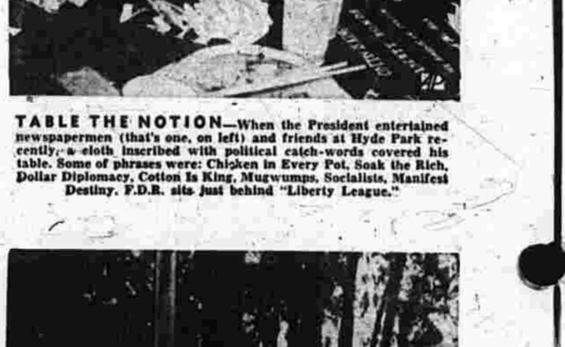
TABLE THE NOTION —When the President entertained newsmen (that's one, on left) and friends at Hyde Park recently, he is seen in action during a recent bout between German and Polish boxers. The referee is seen in action during a recent bout between German and Polish boxers.