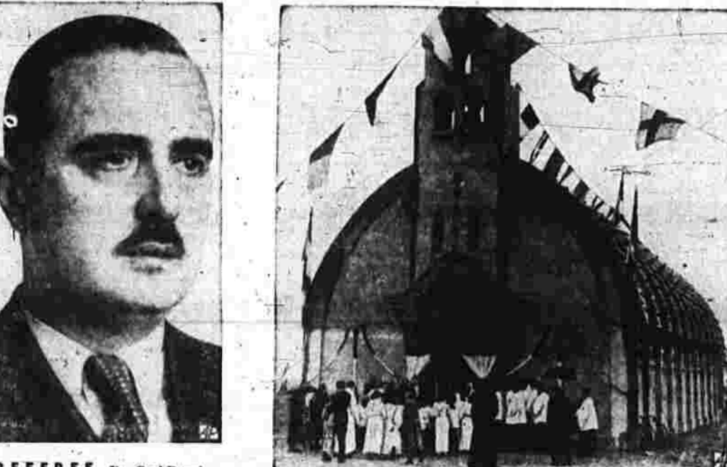
FOR SKY-PILOTING —Shaped like an airplane hangar, this small church was recently consecrated near the French military airport at Ory, near Paris. It is called "Notre Dame de l'Air" and is popular with aviators and mechanics at the nearby field. Flaxstaff, Ariz. He attended Indian pow-wow there.