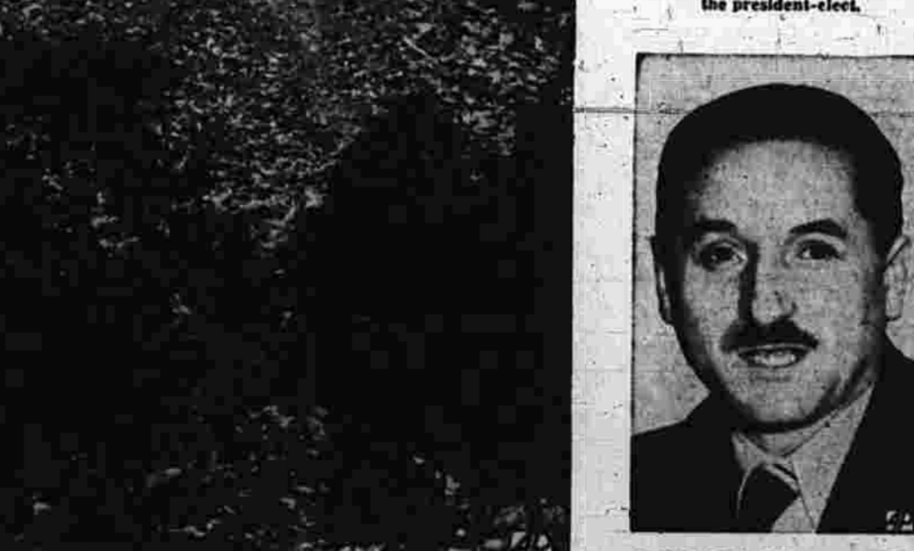
DIPLOMAT —Balkan interests in the "power politics" being played by European statesmen are watched by Ivan Sushkovich (above), new Yugoslavian minister in London.